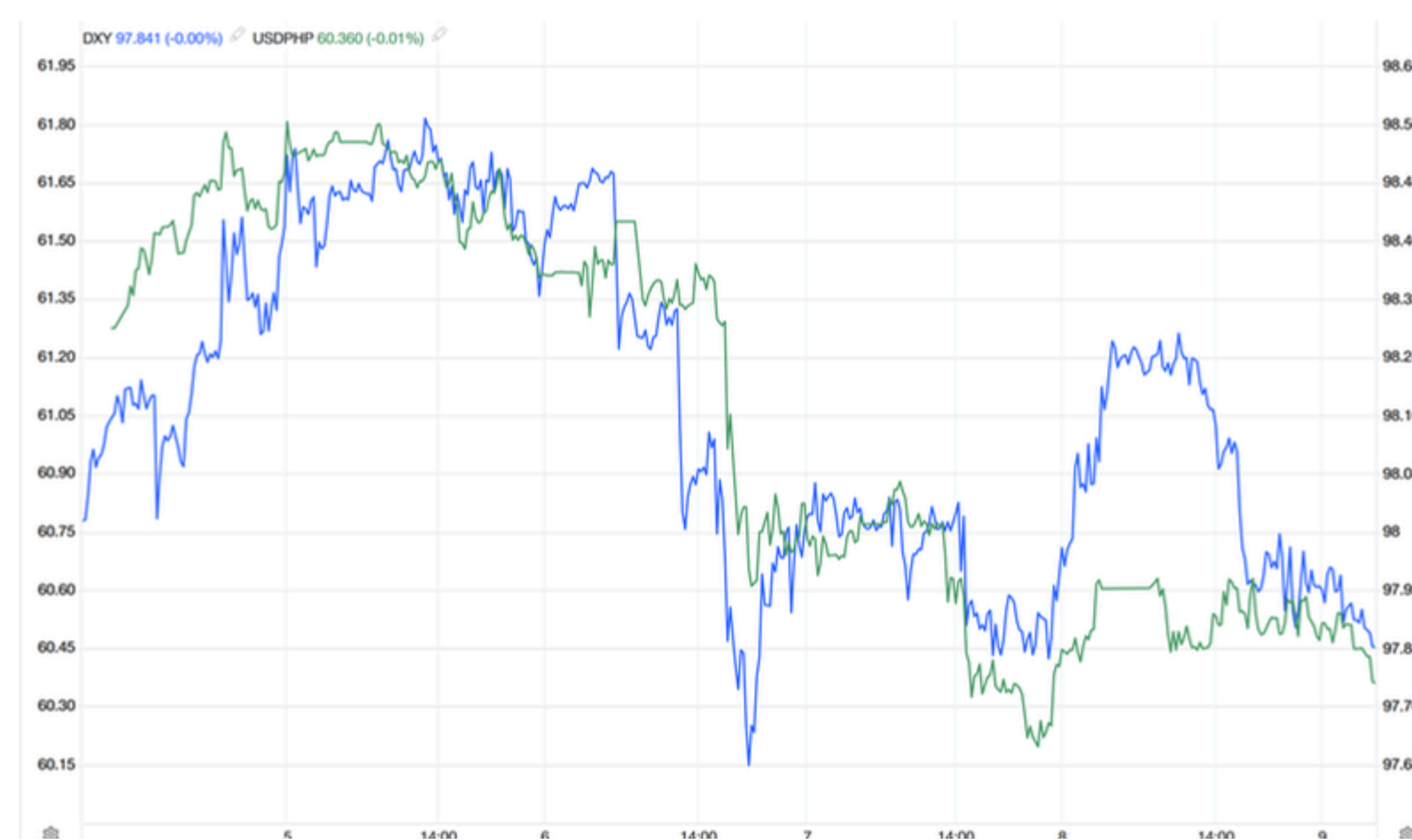
Source: Trading Economics. (2026). US Dollar Philippine Peso. Tradingeconomics.com. https://tradingeconomics.com/united-states/government-bond-yield

Outlook: The combination of faster PH inflation and volatile but elevated crude oil prices, in the absence of a peace, will likely limit the appreciation of the peso-dollar rate. Solid FX demand—final user and traders-- in the last two days last week would also support that view. We don't see compelling reason for a shift back to peso assets given the riskiness of PH bond and equity investments.