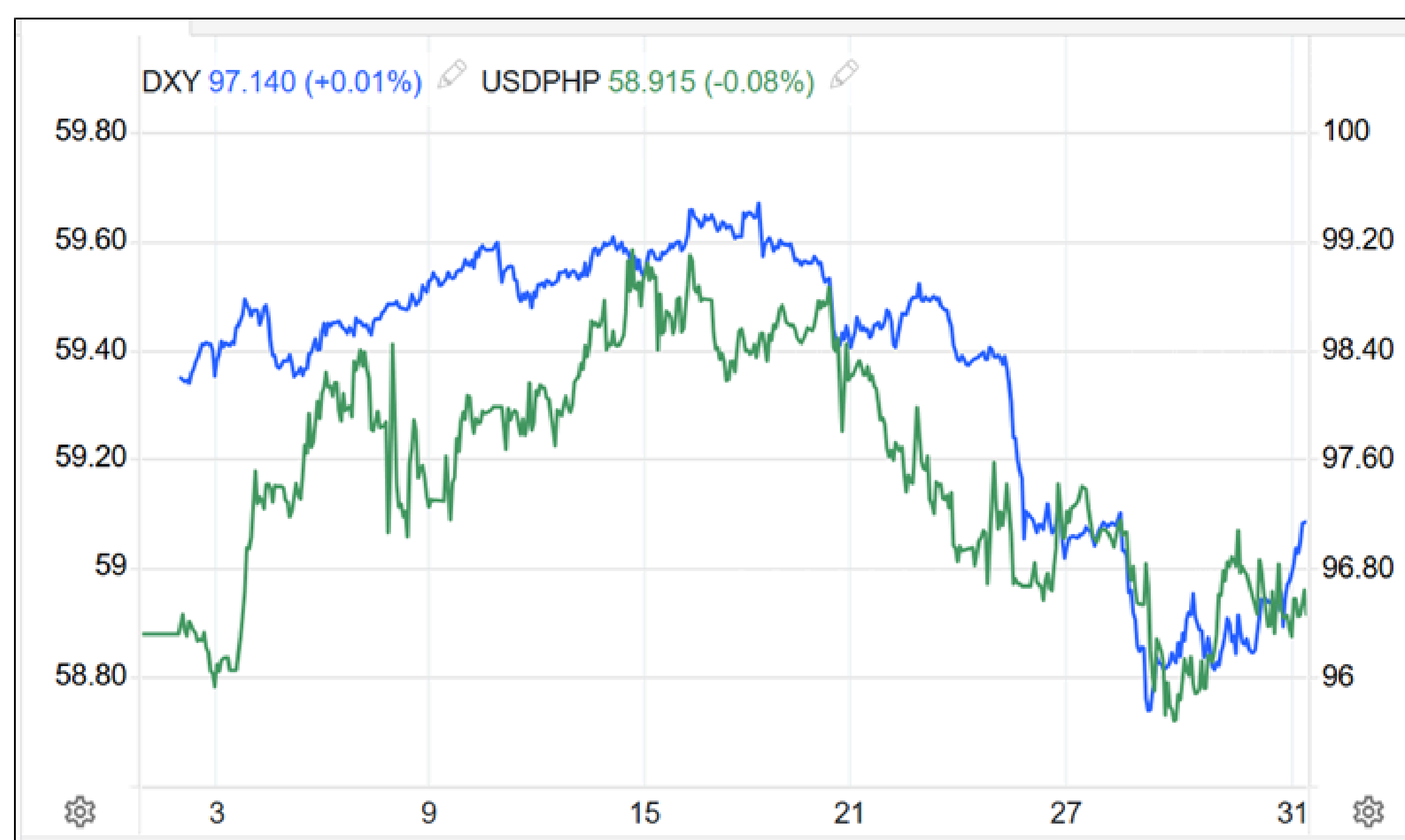
Source: Trading Economics. (2025). US Dollar Philippine Peso. Tradingeconomics.com. https://tradingeconomics.com/usa/government-bond-yield

Outlook: With the very short-term indicators still midway between a buy and a sell, we see a fundamental weakening as BSP's February 17 meeting comes closer, since the market widely expects a policy rate cut while the Fed held rates. However, in the meantime, we may see again a slight appreciation bias as precious metal prices have dropped sharply, enticing market players to drive the USDPHP rate lower early in February and reverse course towards the middle of the month. We should closely monitor BSP interventions especially if the peso weakness becomes too pronounced.